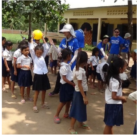
Staff Project: Learning through games and