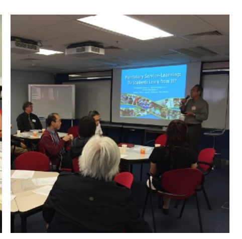
Workshops and Collaborative Forums