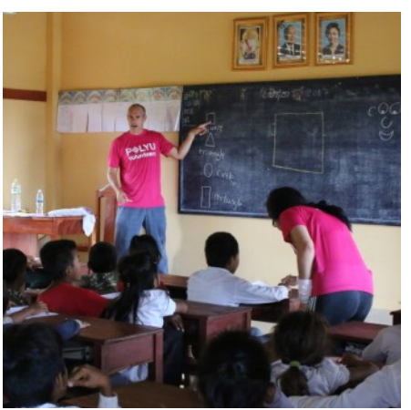
Staff Project: English lessons for Cambodian children to learn English vocabulary